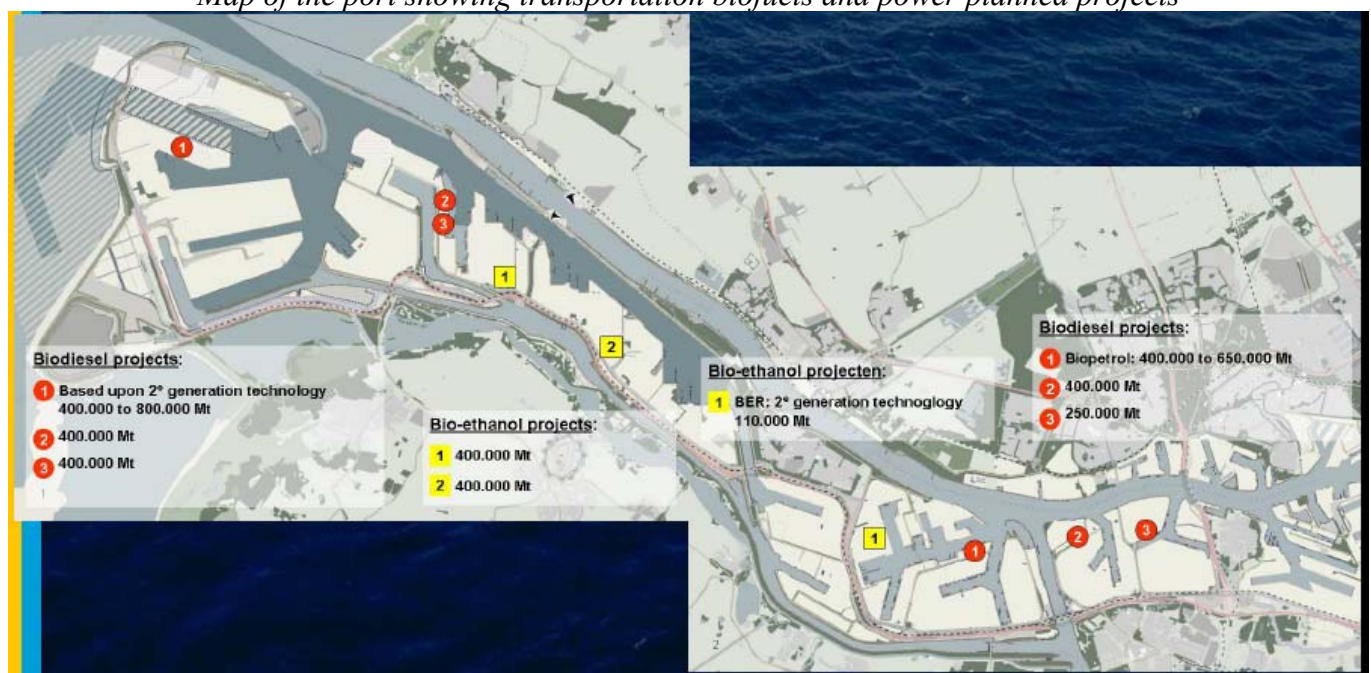
Map of the port showing transportation biofuels and power planned projects

The port is aware about the enormous potential for biomass trade and stands as a main logistic place for the future bioenergy supply of Europe. The port handles already 10 Mt of agri-bulk, 0,3 Mt vegetable oils, 0,5 Mt woody biomass, 1 Mt ethanol and 0,17 Mt biodiesel. It is therefore not astonishing that 9 projects for liquid biofuels production for biodiesel and ethanol, including second generation technologies, are under study for a total capacity of roughly 2 and 1 Mt respectively.