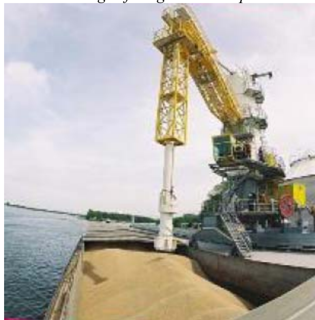
Discharge of barge at Essent plant